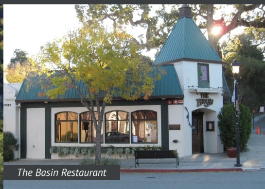
The Basin Restaurant