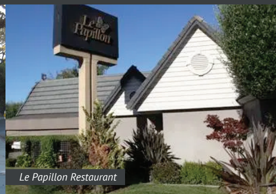
Le Papillon Restaurant