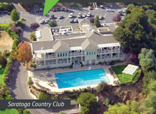
Saratoga Country Club

For hotel reservations, go to http://group.curiocollection.com/CMOCOachesBootcamp and enter the group code "CMO."